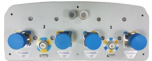
1710-2690 MHz +45° / -45° Polarization(1710MHz)